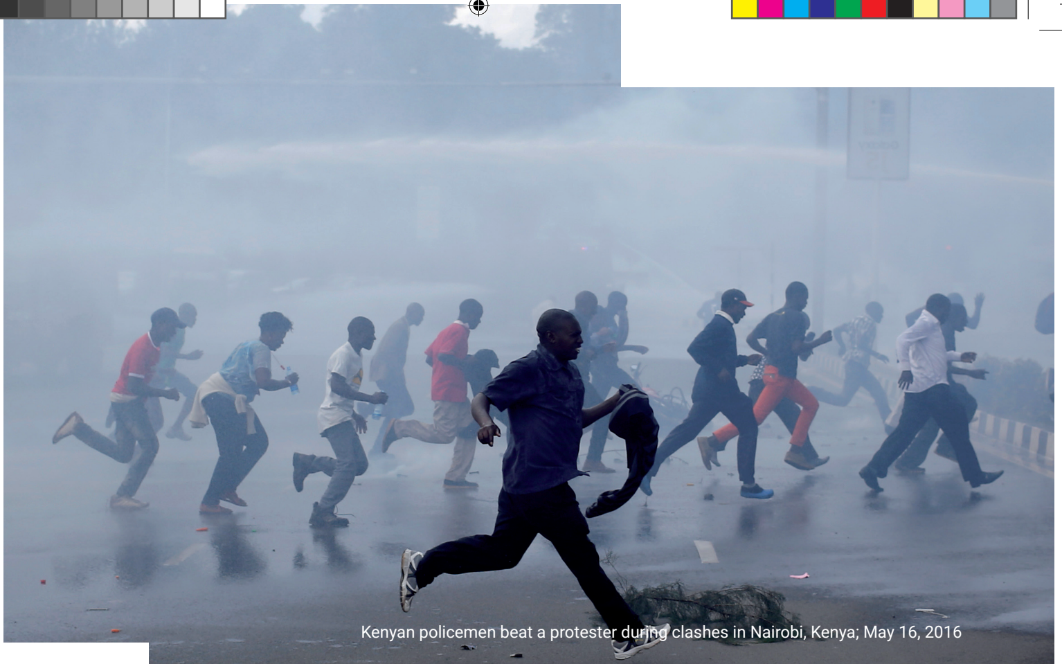
Kenyan policemen beat a protester during clashes in Nairobi, Kenya; May 16, 2016