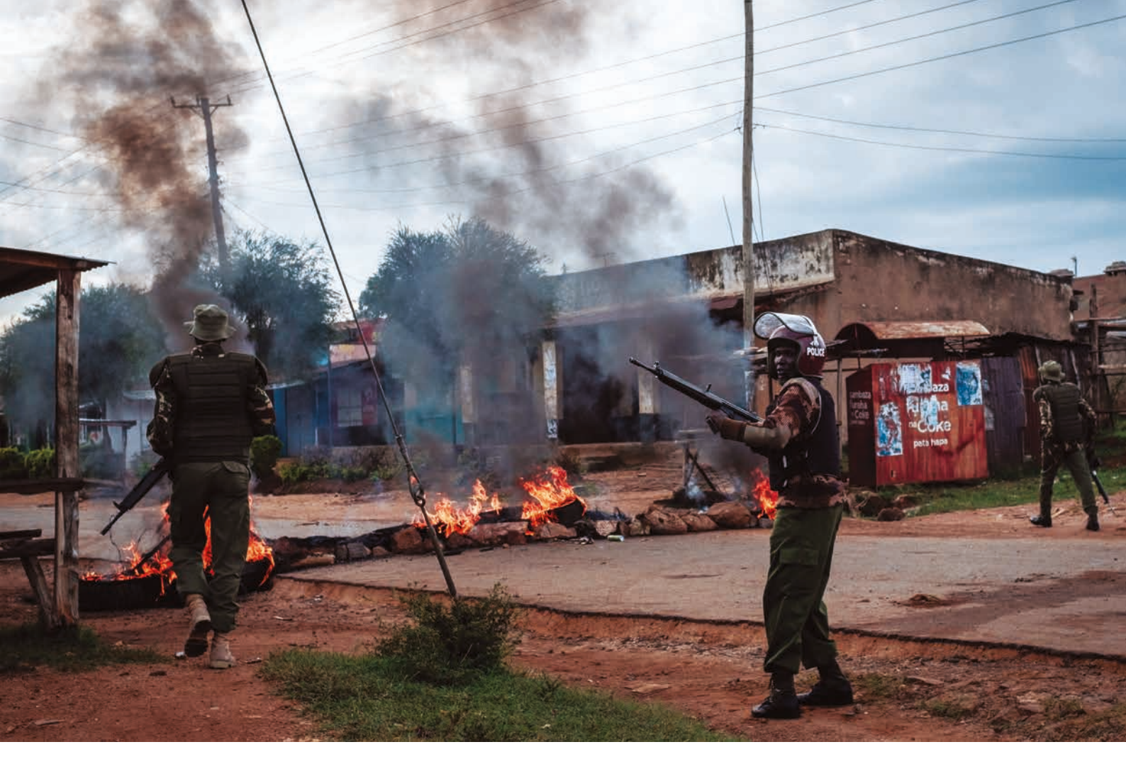
Kenyan anti-riot police officers secure a street blocked by a burning barricade set up by supporters National Super Alliance (NASA) presidential candidate Raila Odinga during a protest in Majengo, about 20 km north of Kisumu, Kenya, on October 28, 2017.

In their joint report, OHCHR, UN Women and PHR pointed out specific deficiencies that illustrate Kenya's failure to investigate, prosecute and ensure accountability for ERDV.<sup>150</sup> Most of these findings concur with FIDH and KHRC's observations, including: the absence of "contingency measures [...] to facilitate the reporting of ERSV to police during the 2017 electoral period";151 the absence of specialised and continuous training for police officers "on the distinct forms, types and manifestations of ERSV";152 the police's "heavy reliance on reporting by survivors in order to initiate investigations";153 the lack of understanding "that investigations should proceed even if the perpetrators' identity is unknown":154 the requirement for survivors to provide corroborating evidence, including forensic medical evidence; 155 the "lack of gender desks or specialised units to handle cases of sexual violence at all police stations". 156