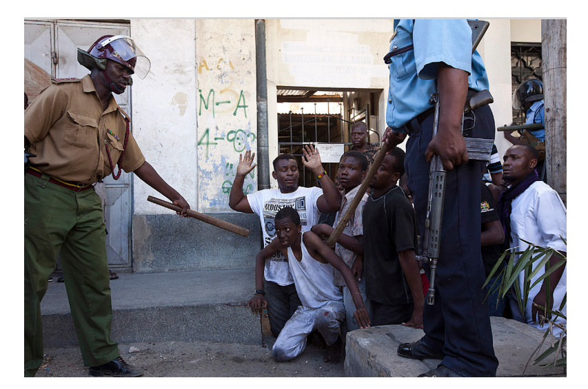
KENYA, Mombasa: Alleged jihadist youths are detained by police outside the Masjid Mussa mosque following a raid, in the Majengo area of Mombasa, on February 2, 2014.

In such a context, the Anti-Terrorism Police Unit (ATPU), which has been granted with extensive powers to conduct counter-terrorism operations, would have been responsible for the perpetration of serious human rights abuses during its operations, including extrajudicial, summary or arbitrary killings, enforced disappearances, arbitrary arrests and detention of terrorists suspects, or acts of torture and ill-treatment against detainees<sup>12</sup>. These violations have been perpetrated in complete disregard for article 238 of the 2010 Constitution which provides that national security shall be pursued in compliance with the law and with the utmost respect for the rule of law, democracy, human rights and fundamental freedoms. So far, and while Kenya is undergoing substantial police reforms aimed at fostering greater accountability within this sector, no effective measures have been taken to ensure that those responsible for such violations are being held accountable and victims have remained without any form of redress.