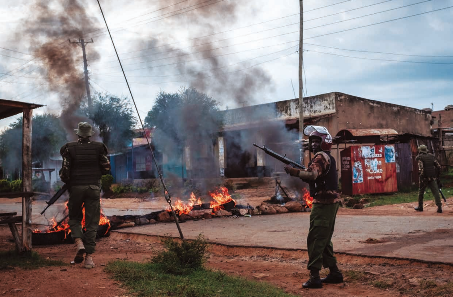
Kenyan anti-riot police officers secure a street blocked by a burning barricade set up by supporters National Super Alliance (NASA) presidential candidate Raila Odinga during a protest in Majengo, about 20 km north of Kisumu, Kenya, on October 28, 2017.

In their joint report, OHCHR, UN Women and PHR pointed out specific deficiencies that illustrate Kenya’s failure to investigate, prosecute and ensure accountability for ERDV. 150 Most of these findings concur with FIDH and KHRC’s observations, including: the absence of “contingency measures [...] to facilitate the reporting of ERSV to police during the 2017 electoral period”; 151 the absence of specialised and continuous training for police officers “on the distinct forms, types and manifestations of ERSV”; 152 the police’s “heavy reliance on reporting by survivors in order to initiate investigations”; 153 the lack of understanding “that investigations should proceed even if the perpetrators’ identity is unknown”; 154 the requirement for survivors to provide corroborating evidence, including forensic medical evidence; 155 the “lack of gender desks or specialised units to handle cases of sexual violence at all police stations”. 156